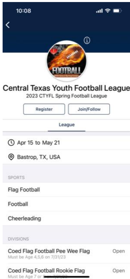
League Registration Page Via Zorts