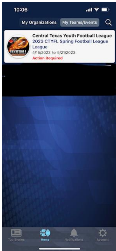
CTYFL League Registration Selection